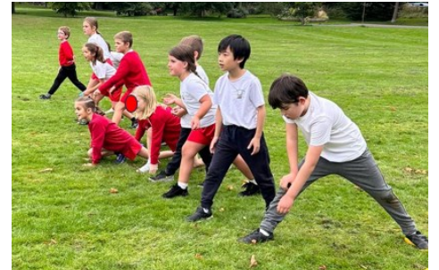
Above—Y3/4 at the Whitworth Park taking part in their sports festival