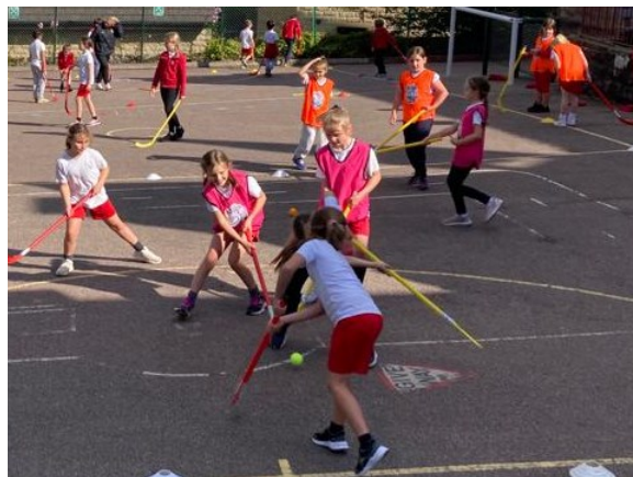
Below and side—PE at school