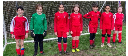
Top row—L—Our Y3/4 High 5 netball team with their certificates, R—Our football team at their latest competition Bottom row L & C Infants at their multi sports athletics event at Highfields R—our medal winning Sportshall Athletics team.