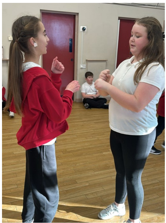
PE in the Village Hall