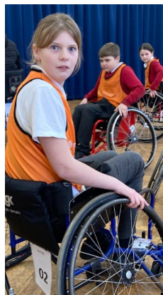
Year 5 enjoying participating in wheelchair basketball

Reminder: FOSDS Curry and Family Quiz night taking place on Friday 28th February 2025 starting at 6pm raising funds for Hastings School, Kolkata. Tickets on sale next week. £7 for adults, £3 for children. Last day for purchasing is Wednesday 26th February. Tickets available from the office.