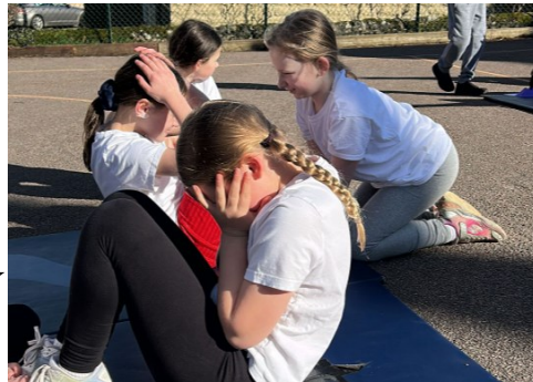
Below: Our Junior Sportshall Athletics team with their 3rd place medals. Left: one of our pupils participating in the event

FOSDS have taken the sad decision to cancel the Charity FOSDS Curry and Family Quiz which was due to take place on Friday 28th February 2025 due to low ticket sales.