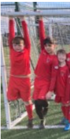
Below centre/right: pupils taking part in PE lessons