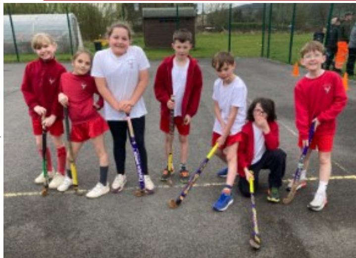
Left: Juniors enjoying attending the hockey festival.

Reminder: Tickets sales close today at 4pm and will open back up to all on Monday morning 10am.