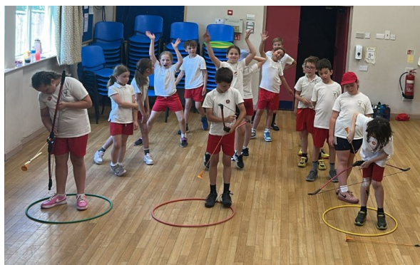
PE in the Village Hall

Reminder: All parents please bring payments up to date on Parentpay ready for the new academic year