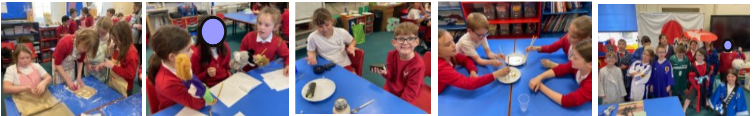
Pictures: left to right: Making German Christmas biscuits, language roleplaying with puppets, making Japanese Sushi, using Chopsticks and dressing up Japanese style

We try to make the lessons as fun and as active as possible, practising phrases and vocabulary (such as numbers, colours etc.), whilst learning about the cultures of the countries that speak that language.